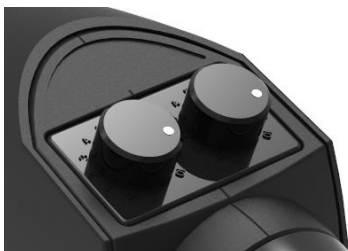
2 potentiometers for easy access to adjust wire-feed speed and voltage.