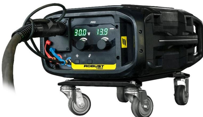
Wheel Kit works with feeder horizontal or vertical