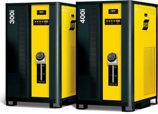
600 A and 800 A are achieved by paralleling two 300 A units or two 400A respectively.